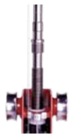
Cold-rolled, centered spindle for very long life.