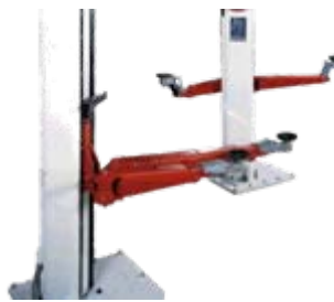
Arms can be parallel-parked.