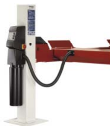
Pump and control unit on front left post.