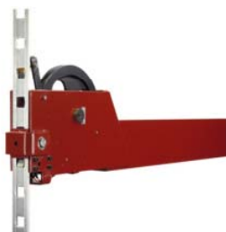
Ratchet, parking system and eccentric brake.