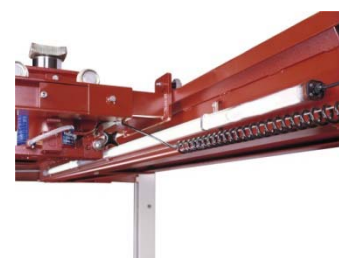
Large program of optional extras; e.g. auxiliary jacks, air connection kits, lighting sets.