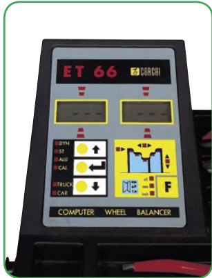
➤ Dual display control panel