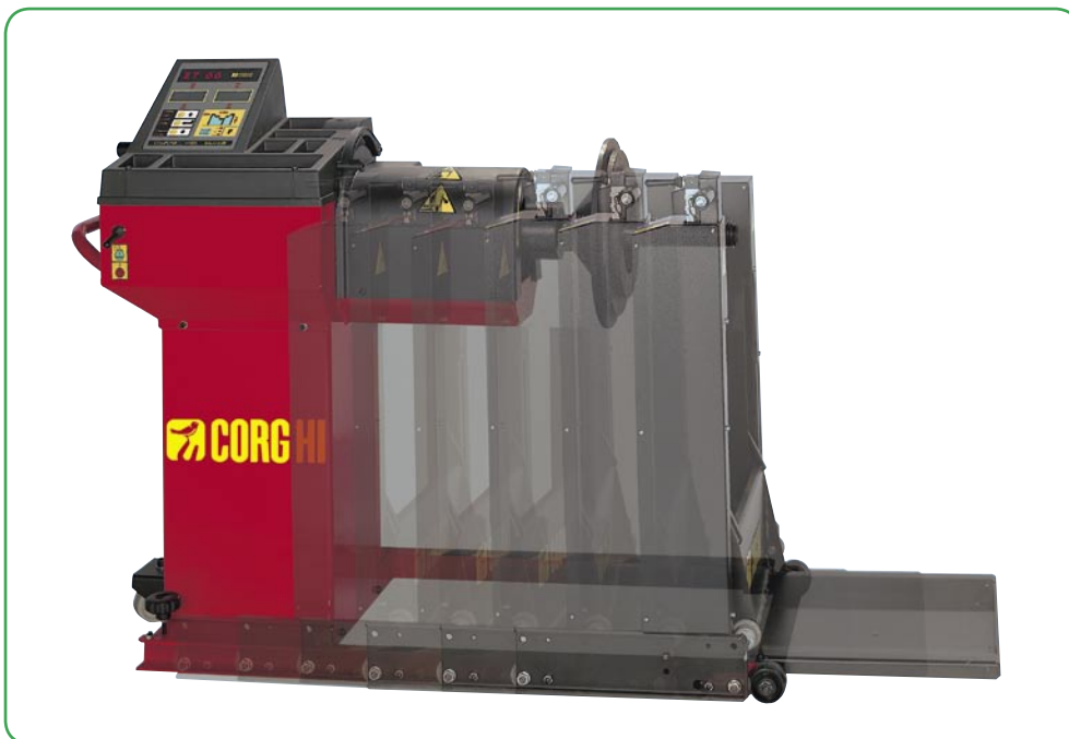
➤ Integrated pneumatic lift for wheels weighing up to 150 kg