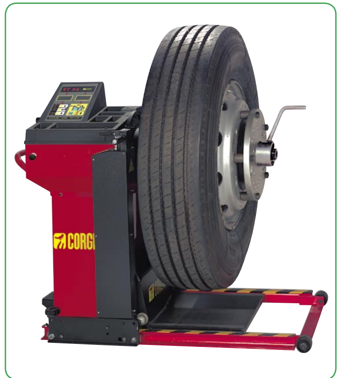
➤ Manual wheel spin version (Hand Spin)